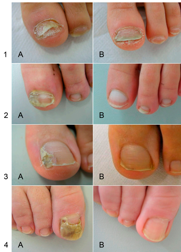
Figure 2. Efficacy of treatment with amphotericin B in topical application for NDM onychomycoses. (A) before treatment; (B) after treatment. The infectious agent identified by PCR was Fusarium sp. in patients 1 and 2, and Aspergillus oryzae in patients 3 and 4. Figure from Monod et al., Rev Med Suisse. 2013, 380:730-3, with permission of the Editor.