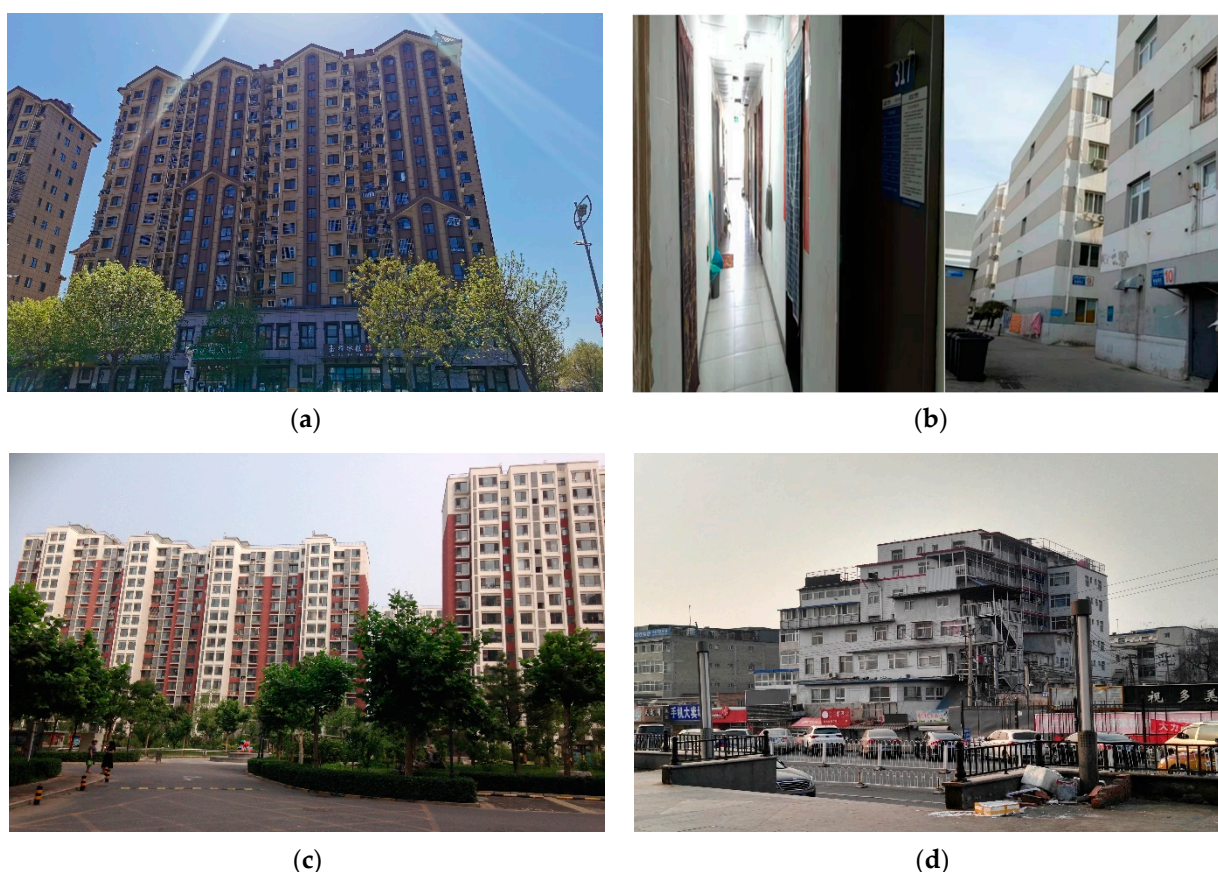
Figure 1. Housing tenure types accessible for migrants in the Beijing metropolis in China (a) commercial housing for self-owning or renting; (b) dormitory provided by employers in the industrial park; (c) public rented housing prepared for talented migrant workers; (d) "urban village" housing.

The typical housing tenure opportunities available to the migrants in Beijing are composed of: (a) self-owned commercial housing; (b) dormitory-like housing provided by governments or employer units; (c) rental commercial housing; and (d) informal housing involving "urban village" housing, small property housing and other types of informalities [55,56]. Figure 1 displays the main housing types accessible to the migrants in Beijing, and Figure 2 demonstrates the conceptual framework that constructs and interprets the aging pre-1970 migrants' integration into Beijing's local society. As shown in Figure 2, we construct a three-tiered measurement of integration (practical, relational, and perceptual), and examine the main determinants of integration (from perspectives of household, migratory, and housing-related) to interpret the variance of aging migrants' integration levels. The housing-related explanatory factors involve housing tenure types and housing expenditure stress. The definitions and measurements of dependent and explanatory factors will be elaborated in Section 3, based on the data availability of the 2017 MDMS.