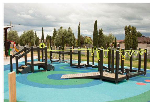
Fig. 1 The Seniors Exercise Park at Thomastown, Melbourne.

fulfil the need for an age-friendly outdoor space for older people to be physically active in the community [12–14]. Active ageing has been defined by the World Health Organisation as “the process of optimizing opportunities for health, participation and security in order to enhance quality of life as people age” [15]. The ENJOY project was based on our previous research that demonstrated the effectiveness of the Seniors Exercise Park program on improving physical function and social health in older people [16, 17]. The ENJOY project involved two Victorian local Councils (Wyndham and Whittlesea City Councils) and another partner agency (Old Colonists' Association of Victoria, a residential aged care and seniors living provider). The project included the installation of specialised outdoor exercise equipment (the Seniors Exercise Park, Fig. 1) together with the delivery of physical and social activity program for inactive older people (age 60 years and over) as part of a prospective pre-post research design [12, 13]. In contrast to some other existing outdoor exercise equipment in community parks that mostly focus on strength and or fitness exercise (gym-like machines), the Seniors Exercise Park incorporates multiple exercise stations that include balance, strength, function, flexibility and dexterity exercises [18]. Project timelines included 6–12 months preparation and discussion with local governments followed