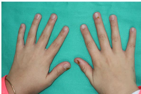
Fig. 1 An 11-year-old girl during the first session of treatment with NZCS. Note the change in color of the treated area. The informed consent included permission to use images of patients