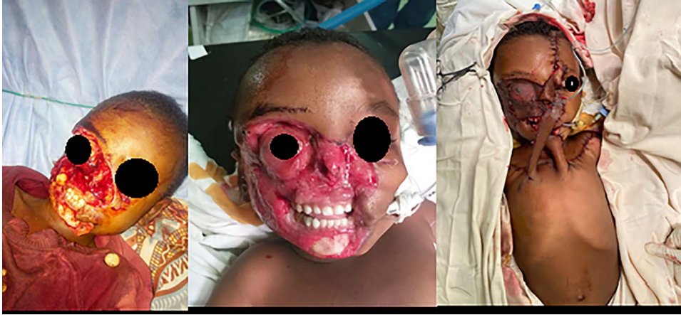
Figure 2: A 4-year-old male patient with hyena bite to the face resulting in loss of nose, eyelids, cheek and lips.