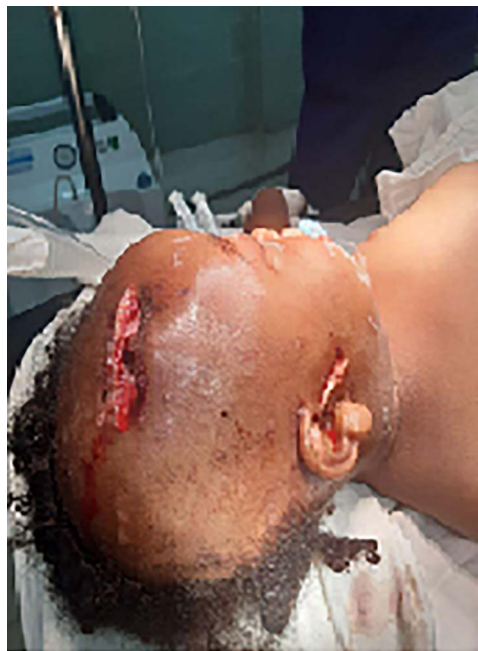
Figure 1: A 2-year-old female patient with hyena bite to the head resulting in a compound depressed skull fracture.

A 2-year-old female child from a rural area in the southern region of Ethiopia presented 18 h after sustaining a hyena bite while playing outside in her neighborhood. The bite was over the head and face with a compound depressed skull fracture with visible dural tear and oozing of brain tissue as well as a pre-auricular laceration. Proper irrigation and debridement with removal of fragments of bone and dura-plasty were done for 3 × 2 cm