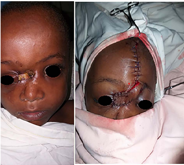
Figure 3: A 9-year-old male patient with hyena bite to the face resulting in exposed nasal bone.