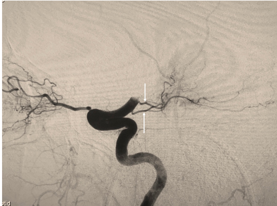
FIGURE 2: Patient evaluated with angiography to evaluate for acute stroke and noting duplicated anterior choroidal arteries (arrows).

Duplicated AChAs are rare and/or underreported [2, 4-6] (Figure 2).