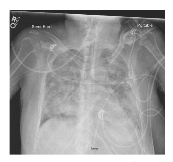
Figure 2 Portable AP chest X-ray post-transfusion. Complete bilateral airspace opacities.