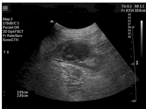
Fig. 2. Transverse US image of the upper pole of the transplanted kidney demonstrating a complex hypoechoic mass with no through transmission.

cholangiopancreatography (MRCP), performed around that time for biliary symptoms, the transplanted kidney was couched incidentally in T2-weighted series. It showed a 2 cm round mass of low T2 signal intensity. The transplanted kidney was not included in further study series and was not evaluated with T1-weighted imaging. These findings on MR alone can be compatible with a solid mass or a complex cyst. The solid appearance on the current ultrasound coupled with the increase in size as demonstrated by retrospective radiological data, made it highly suspicious for renal cell neoplasm.