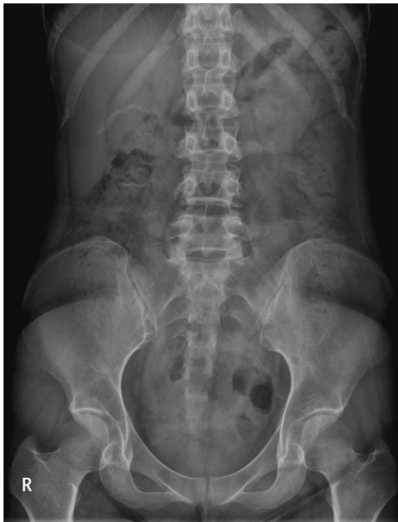
Figure 4. Radiograph 12 months after capsule endoscopy shows disappearance of the capsule.