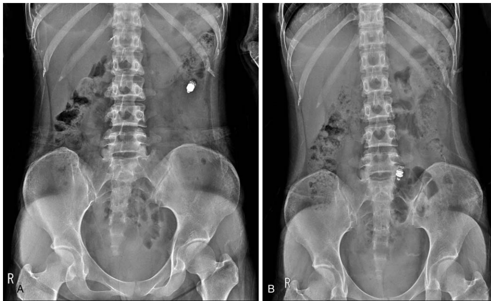
Figure 1. Serial abdominal radiographs after capsule endoscopy. (A) Radiograph 2 weeks after capsule endoscopy shows capsule retention in the left upper quadrant. (B) Radiograph 3 months after capsule endoscopy shows capsule retention in the lower abdomen.

Five months after VCE, her abdominal pain worsened. CT enterography showed capsule retention near the stenosis in the ileum and enlargement of the small bowel proximal to the stenosis. It was determined that the stenosis was too severe for the capsule to be naturally retrieved and single-balloon enteroscopy was performed. During the procedure, multiple areas of stenosis were found in the jejunum and it was impossible to pass the enteroscope through the proximal ileum (Fig. 2). Thus, enteroscopic capsule removal was failed because the enteroscope could not reach the location of capsule retention. Although the operation was considered because enteroscopy was failed, her obstructive symptoms were not distinctive relative to her pain, thus it was decided to increase the dosages of azathioprine and