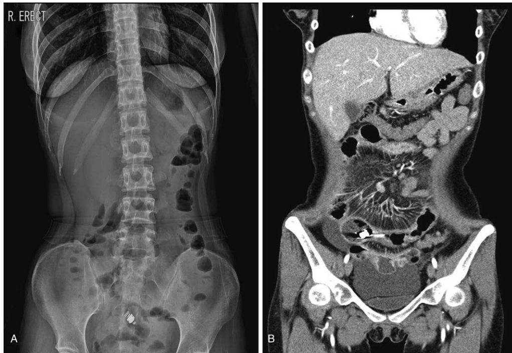
Figure 3. Abdominal radiograph and computed tomography scan 11 months after capsule endoscopy. (A) Stepladder sign and capsule retention are identified in the lower abdomen. (B) Multifocal wall thickenings and luminal narrowing are observed in the ileum, and capsule retention is identified near the luminal narrowing.