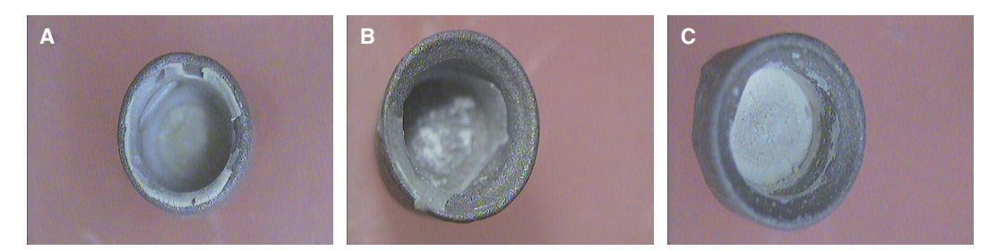
Fig. 4. Intaglio surfaces of metal coping after pull-out test under a light microscope. (A) RMGI (More the 75% remaining cement on coping surface), (B) Resin cement (Between 25% and 75% remaining cement on coping surface), (C) ZOE (Less than 25% remaining cement on coping surface).

Failure area was investigated under a light microscope (Nikon, Japan) (Fig. 4). Failure modes were classified into three categories: adhesive failure (complete separation of cement from the abutment or coping), cohesive failure (failure within the cement) and mixed failure (a combination of the two above). Since a coping is a combination of several surfaces and the failure mode is different in different surfaces of a coping, the failure modes were categorized as follows: more than 75% of the cement remained on the coping; between 25% and 75% of the cement remained on the coping; less than 25% of the cement remained on the coping.30,35 The axial walls were considered as 4 surfaces and the occlusal wall was considered as one surface, with each surface being considered 20%. The dislodging forces were statistically analyzed with Two-way ANOVA, post hoc Tukey tests, and paired t-test ( \alpha = .05 ).