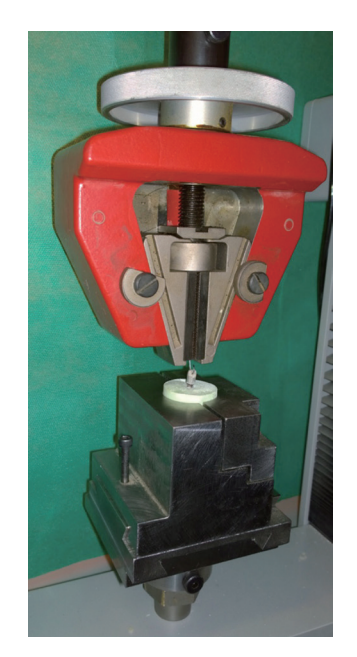
Fig. 3. Pull-out test with a cross-head speed of 0.5 mm/ min in the universal testing machine.

In the 20 specimens of temporary cement group, after testing, the temporary cement was cleaned from the intaglio surface of the coping and abutment surfaces. The removal procedure of temporary cement consisted of gross removal with the explorer, ultrasonic bath with ethanol for 15 minutes, and a 30-second application of 37% phosphoric acid for complete removal of cement remnants. The specimens were then rinsed and dried.<sup>21</sup> The abutments were also cleaned in an ultrasonic bath for 5 minutes and dried.<sup>4</sup> After re-cementation with a resin cement, incubation, and thermocycling, the pull-out test was repeated.