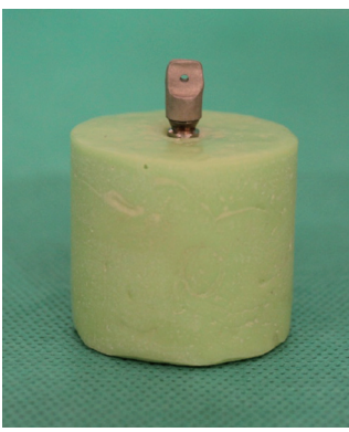
Fig. 1. Shortened abutment in acrylic resin block.