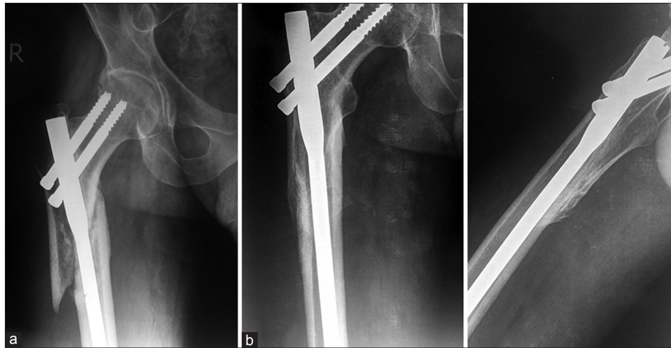
Figure 2: X-ray right hip joint with thigh (a) anteroposterior view showing surgically intervened delayed union proximal femur (b and c) Followup anteroposterior and lateral radiographs showing union