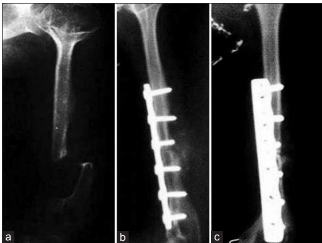
Figure 3: (a) X-ray of arm anteroposterior view showing atrophic nonunion of fracture of humerus (b and c) Followup anteroposterior and lateral radiographs showing union