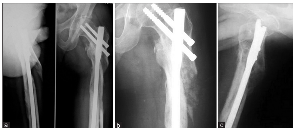
Figure 5: (a) Surgically intervened delayed union proximal femur. The patient had postoperative infection (b and c) Union despite of infection evident by bridging callus in both anteroposterior and lateral radiographs

cellular debris. 12 This makes the graft porous through which neovascularization propagates. Release of osteoinductive material (e.g. BMP) by the autograft leads to conversion of osteoprogenitor cells to osteoblastic cells that lay down new bone on the porous matrix by the process of creeping substitution. In autografts, the mineral and organic material must undergo resorption before creeping substitution starts, whereas in decal bone resorption of demineralized matrix is faster because of the prior removal of nearly half of minerals in the laboratory. Decal bone provides an easily permeable scaffolding structure that permits creeping substitution.