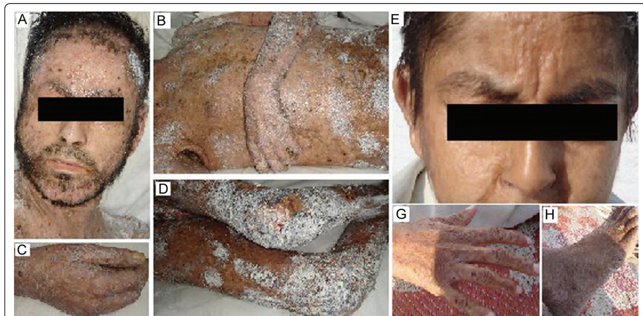
Figure 1 Clinical presentation of the lipoid proteinosis patients. (A) A 23 years old patient with yellow-white infiltrates and diffuse acneiform scars on the face; yellow discoloration of lips is also prominent; (B) Infiltrated skin of the trunk and upper extremities with numerous scars; (C, D, G, and H) Warty skin, thickening & infiltration on the hands, legs, knees and foot. (E) A 15 years old patient with nodular or diffuse yellow waxy infiltrates located on the face; pseudo solar elastosis of the cheeks and forehead.

For detection of mutation in the ECM1 gene, 8 sets of primers were used to amplify all coding exons and adjacent splice sites by PCR. PCR products were initially screened for mutations by single stranded conformational polymorphism (SSCP) analysis. For this, aliquots of 10 \mu l of each PCR product was mixed with 10 \mu l denaturing solution (95% formamide, 20 mM EDTA pH 8.0, 0.05% xylene-cyanole and 0.05% bromo phenol blue), heated for 7 min at 95°C in PxE thermal cycler (Hybaid, Basingstoke, U.K.) and chilled quickly on ice for 5 min. Denatured DNA was subjected to 8% polyacrylamide gel electrophoresis (20 \times 20 \times 0.1 cm) containing 7% glycerol and 1 \times tris-borate EDTA (TBE)