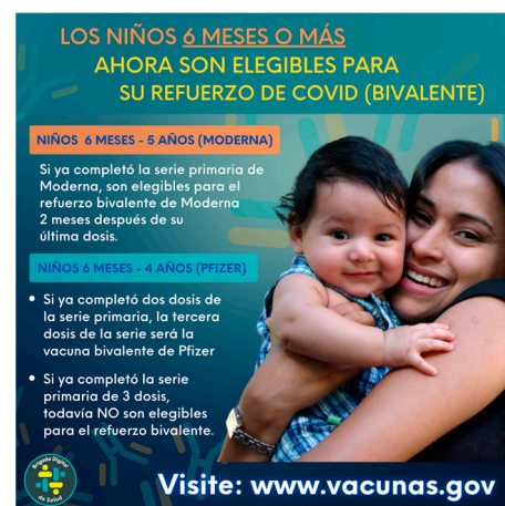
Figure 1. Post announcing COVID-19 vaccine availability for children under age 5.

Given the rapidly evolving nature of the pandemic and the need for specific, sometimes unpredictable, messaging to be developed quickly, weekly content development for Brigada Digital also evolved to incorporate messages that were responsive to contextual factors and salient phenomena in the information environment. For example, when public health policies and guidelines changed, the results of a new vaccine trial were released, child vaccines were approved for certain age groups, free COVID-19 tests were newly available, or there was news coverage of a new variant, messaging would immediately pivot to prioritize the dissemination of this information (See Figure 1).