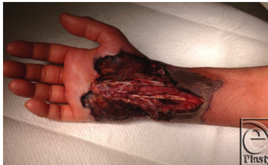
Figure 1. Initial wound prior to first operating room debridement. Significant necrotic tissue is noted at the edge of the wounds with concentric expansion from the centrally located original incision over the carpal tunnel.

and the patient went home as an outpatient the same day. She represented to the hand surgeon on day 2 postoperatively with complaints of wound drainage and increased pain. The incision was opened proximally and distally and a Penrose drain was placed. The patient returned 3 days later after calling with complaints of worsening drainage, fever, and pain. The patient was seen in the emergency department, and it was determined that additional debridement should be undertaken (Fig 1). The patient underwent debridement that evening. The next day, additional necrotic tissue had developed, and it was determined that the patient should undergo additional debridement. This debridement resulted in exposed tendon and median nerve (Fig 2). The patient was transferred following this surgery for higher level of care and soft-tissue coverage.