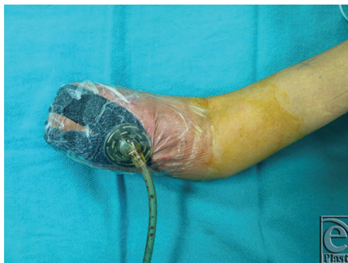
Figure 4. Affected arm after transradial mid-forearm amputation. Systemic immunosuppression was initiated prior to this procedure. VAC therapy was initiated and continued until the patient successfully healed this wound without further wounds or complication.

In light of additional surgical intervention, immunosuppression was optimized with the addition of cyclosporine 4 mg/kg as an adjunct to the dapsone and prednisone taper. The patient 3 days later underwent mid-forearm amputation, partial closure, and application of wound VAC (Fig 4). She was discharged from the hospital with a wound VAC approximately 1 week after her final surgery. The patient's post-hospital course has been relatively uneventful. She developed an additional lesion after discontinuation of cyclosporine, which was restarted shortly thereafter. Her wound healed completely approximately 1 month after initiation of immunosuppression and last surgical intervention. The patient's operative course is summarized in Table 1. The patient experienced 1 episode of remission after discontinuation of cyclosporine, which was reinitiated. This wound healed with dressing changes. The patient was weaned from immunosuppression after her wounds healed. She has not yet undergone an additional surgical procedure to evaluate for evidence of recurrence. The dermatology team recommended suppressive steroids prior to surgery to avoid recurrence or flare-up.