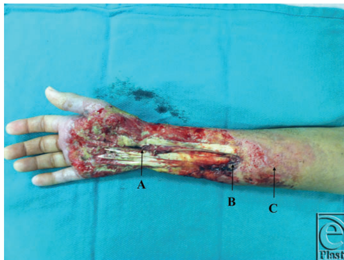
Figure 3. Wound after additional debridement of the enlarged wound. A: The median nerve is now exposed, as the flexor tendons are now devoid of paratenon and are no longer viable soft-tissue coverage. B: Necrosis noted at the musculotendinous junction. Subsequent debridement would result in dehiscence of the muscle and tendon at this level. There is also intradermal purulence visible. C: Appearance of violaceous periwound, which was previously not observed.

The patient returned to the operating room 1 day later for additional debridement, which revealed frank necrosis of an exposed median nerve at the mid-forearm level (Fig 3, A) and dehiscence of all flexor digitorum profundus and flexor carpi radialis tendons at