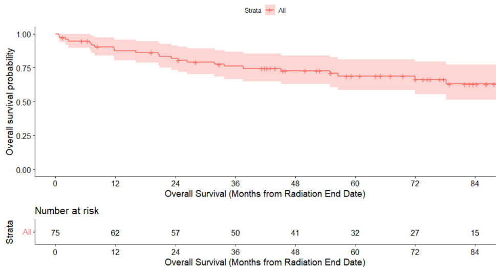
Figure 3 Overall survival curve for 75 patients with HIV and anal cancer treated with definitive chemotherapy and radiation therapy.