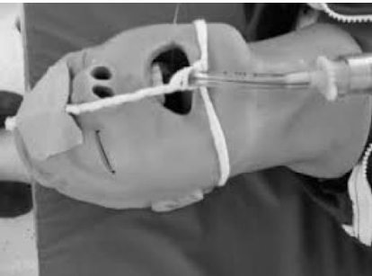
Figure 2: Bandage technique for securing endotracheal tube

study. Informed consent was obtained from the participant relatives.