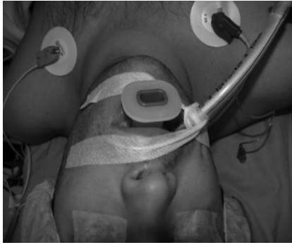
Figure 1: Adhesive tape technique for securing endotracheal tube