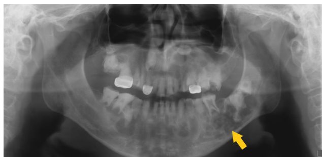
Figure 1. Panoramic view: depicting mixed density lesions in maxilla and mandible. The inferior alveolar canals are displaced inferiorly, especially on left side (yellow arrow).

of the medical history was noncontributory. There was no relevant family history, and he denied a history of pain, numbness/paresthesia, facial asymmetry, or drainage. Intraoral examination revealed condyloma acuminatum on the lower lip.