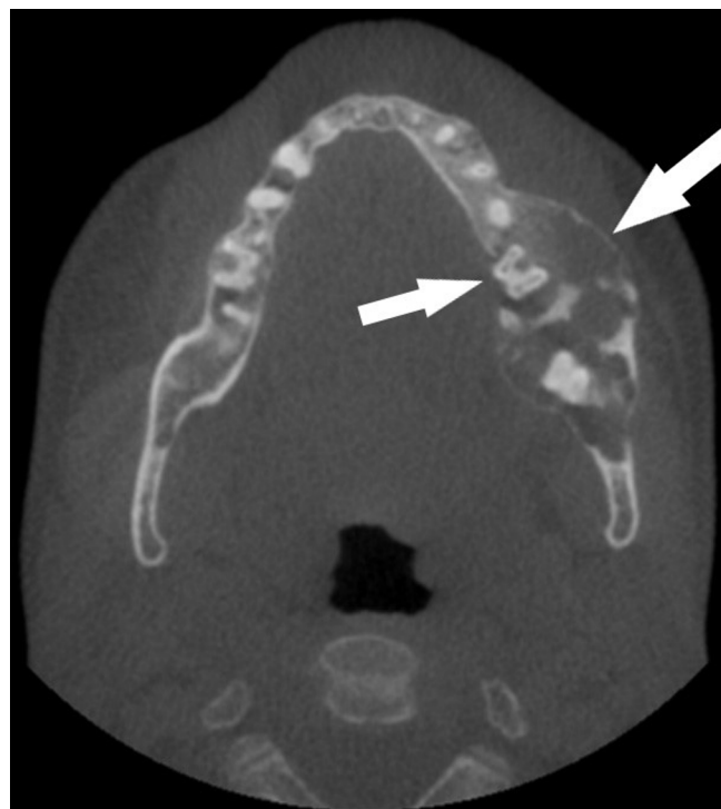
Figure 5. Axially reconstructed CBCT of the jaws depicting buccolingual enlargement and disruption of the lingual cortical plate. CBCT, cone beam CT.

AI is classified into 17 types based on the gene mutation pattern; however, in relation to clinical and radiographic appearance, there are four main types. 11 First, hypoplastic AI type is characterized by thin, rough, pitted, and discolored enamel with lack of the normal proximal contour, radiographically the teeth appear to have square-shaped crowns, a thin radiopaque layer of enamel, and multiple open contacts. 6,10 Second, hypomaturational type AI is characterized by soft, brown colored enamel of normal thickness, but with a radiopacity similar to dentin. Third, hypocalcified type AI is characterized by brittle, orange-brown colored enamel of normal thickness which has less radiopacity than dentin. Fourth, hypomaturational-hypoplastic with taurodontism type AI is characterized by thin, pitted, mottled, white-yellow-brown colored enamel which has a similar or greater radiopacity than dentin. 6 Amelogenesis imperfecta can occur alone without any other signs and symptoms, or it can occur as part of a syndrome that affects multiple parts of the body. 6,11