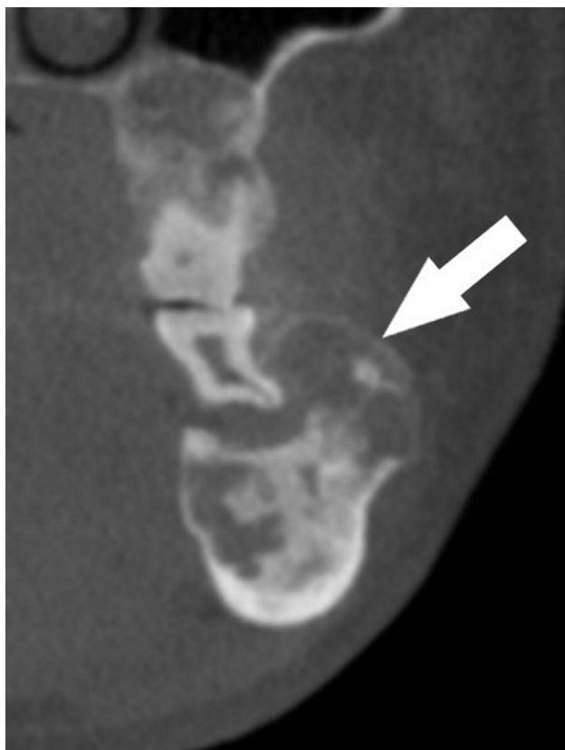
Figure 4. Coronally reconstructed CBCT of the left side of the mandible: depicting thinning of the buccal cortical plate. CBCT, cone beam CT.

appearance varies from complete radiolucent through mixed (radiopaque-radiolucent) to complete radiopaque lesions. 9,10 Treatment or intervention such as biopsy are not recommended in FOD patients, rather observation and periodic radiographic follow-up are advised. Avoidance of intervention is to obviate complications like prolonged poor healing and secondary infection which can lead to osteomyelitis or jaw fracture. 9 The differential diagnosis of FOD includes Paget disease of the bone, chronic sclerotic osteomyelitis, and Gardner syndrome. Paget disease is commonly seen in white males, and has an increase in serum alkaline phosphatase levels. 9,10 Radiographically, Paget disease affects the entire mandible whereas FOD affects the body of the mandible superior to the inferior alveolar canal. Chronic sclerotic osteomyelitis tends to be unilateral rather than bilateral, and it is not confined to the tooth-bearing region of the jaw. Gardner syndrome presents other skeletal changes such as osteomas, skin tumors or dental anomalies such as multiple odontomas, which is not the case in FOD. 9