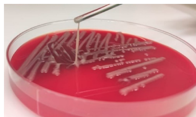
Figure 1. Hypermucoviscous phenotype of the hvKp strain 18-0005. The hypermucoviscous phenotype is represented by a positive “string test”.

In the reported case, a 33-year-old male patient presented a tonsillopharyngitis caused by a community-acquired hvKp strain. Although pyogenic liver abscess is the hallmark clinical syndrome, the clinical picture of hvKp infections is diverse and pharyngitis has been described before occasionally [7,15]. After treatment with octenidine mouth and throat rinse the patient remained clinically asymptomatic without disseminated infections. This suggests that an early detection and treatment of hvKp infections may be important to prevent an invasive progression. Diabetes, alcoholism and HIV are host risk factors that have been associated with hvKp infections [4]. However, the medical history of the patient showed no underlying diseases. The analyzed isolate 18-0005 presented a hypermucoviscous phenotype, that is one of the defining features of hvKp strains (Figure 1) [16]. Although the direct association of hypervirulence with hypermucoviscosity is controversial, this case demonstrates that a positive string test is a strong indicator for presence of a hvKp strain. Isolate 18-0005 was fully susceptible to all tested antibiotics, which agrees with previous studies on hvKp (Table 1) [17].