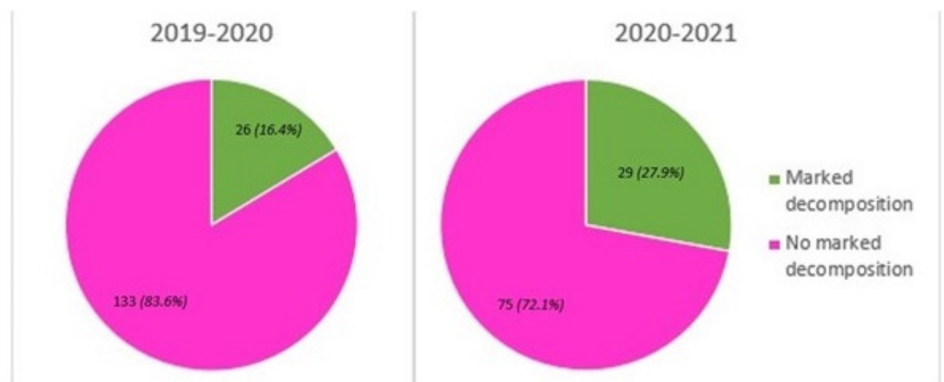
Figure 1 Frequency of marked decomposition change of studying cases.

The frequency of autopsy reports assigning cause of death as 'unascertained' demonstrated a 52.9% increase in 2020–2021; however, this change was not statistically significant ( p=0.331 ); this is most likely due to the sample size being too small, as the absolute number of 'unascertained' cases is generally very low (3.8% across both cohorts). Of the 10 'unascertained' deaths, 90% of them showed marked decomposition change.