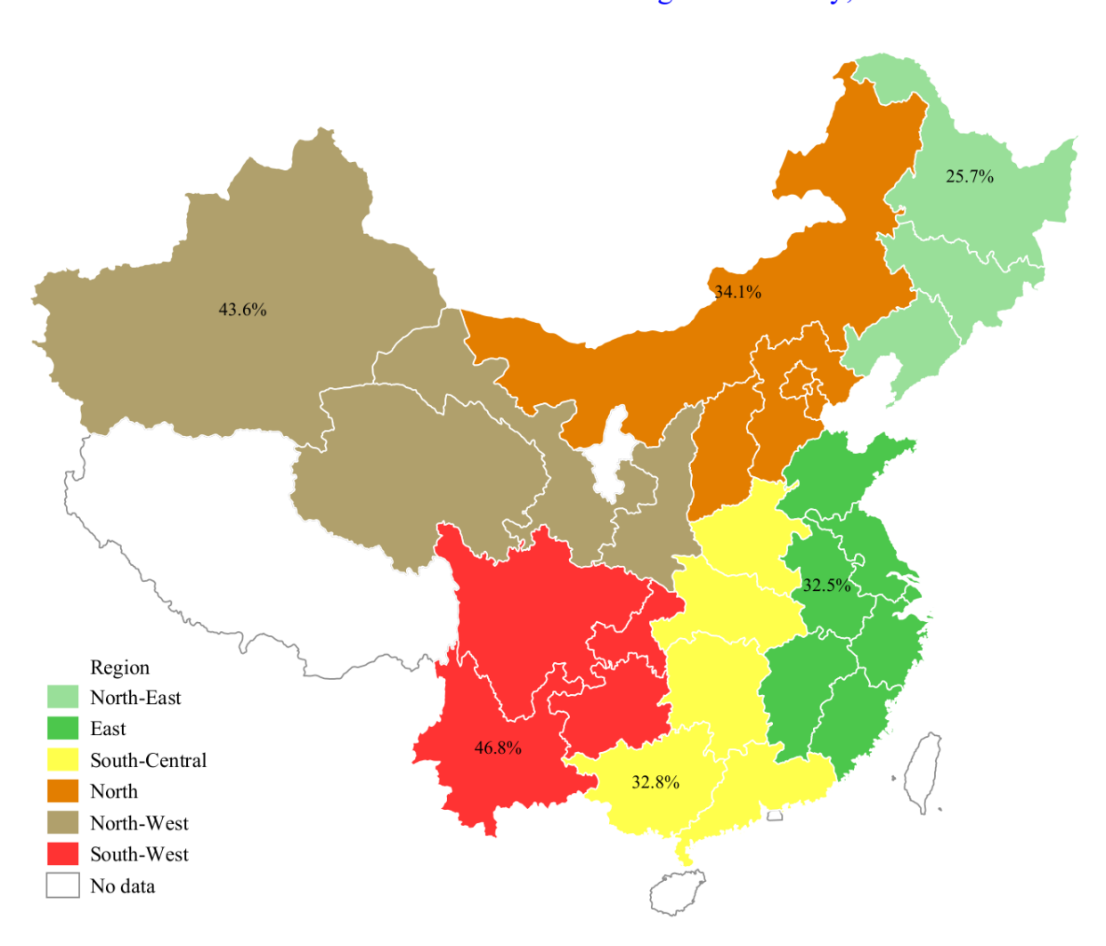
Figure 1. The age-adjusted somatic-mental multimorbidity (SMM) prevalence by geographic location in China, 2013.