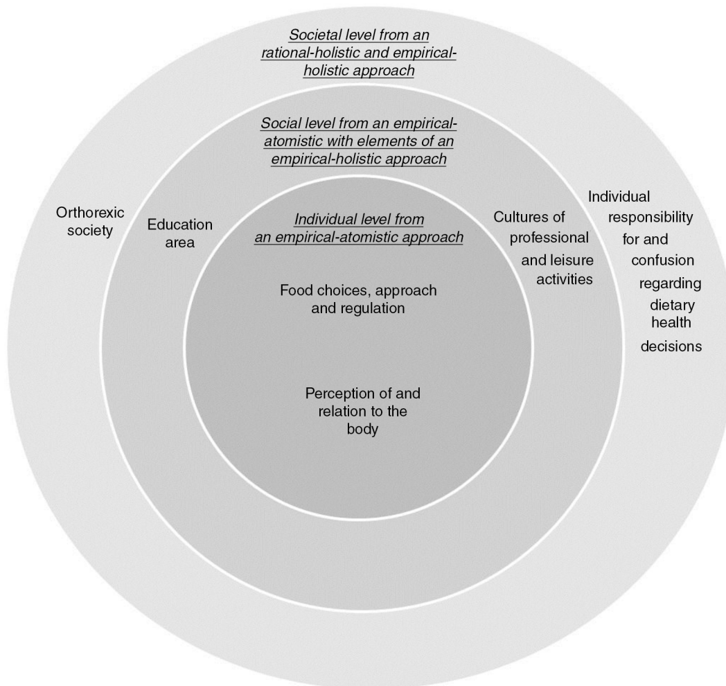
Figure 3. A model that synthesizes the categories that have been examined in relation to orthorexia, sorted by philosophy of science approaches at an individual, social, and societal level.

The multifaceted nature of the research demonstrates that orthorexia has been researched on individual, social, and societal levels using four different approaches (Figure 3). Even so, most of the articles corresponded to an individual level from an empirical-atomistic approach that focused on orthorexia as an individual issue. Sorting and synthesizing the research according to these different levels illustrate that individuals are influenced by multiple factors and systems on varying levels. Thus, the environment that surrounds individuals should be regarded as a series of nested levels; each outer level is inclusive of the inner ones (cf. levels within social-ecological model; Stokols, 1996). The first inner circle is called the individual level and covers the aspects that immediately influence the individual, such as the individual’s behaviours, biology, and psychological and medical conditions. The next circle refers to the social level , which involves contextual and cultural