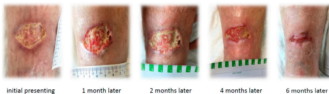
Figure 1. Initial wound finding and course of wound healing.

Laboratory chemical examinations (Table 1) showed a mildly reduced renal function, slightly increased albumin-corrected calcium and parathyroid hormone, and a deficiency of vitamin D and albumin.