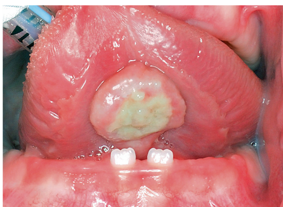
Figure 1 Indurated, non-tender, ulcerative swelling on the ventral surface of the tongue measuring 1.5 by 1.5 cm. Impressions of the primary lower central incisors were seen in the middle of the lesion.

Search. A summary of all these reported cases is shown in Table 1 [1-29].