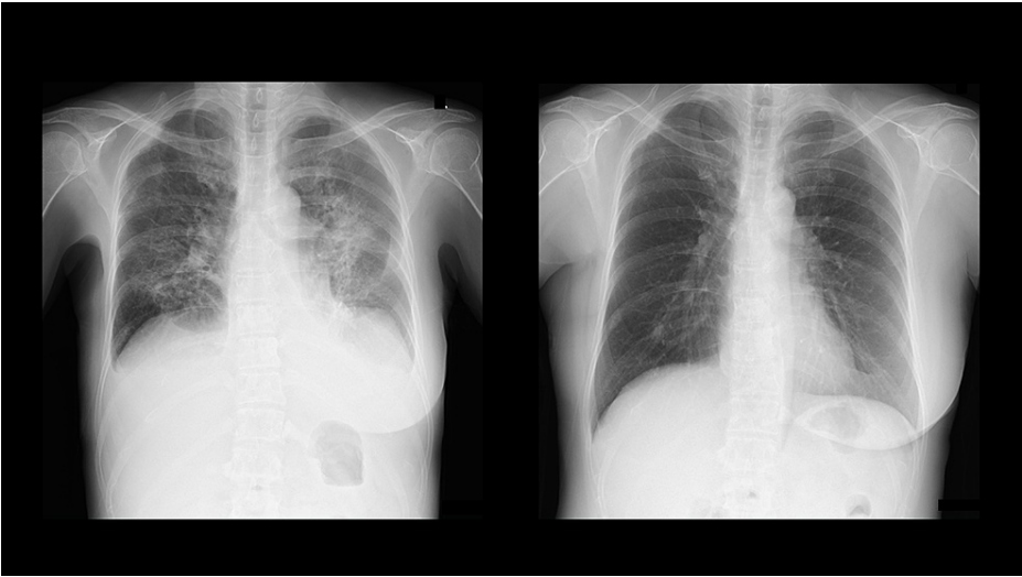
FIGURE 1: Chest X-ray before and after treatment.

Left: chest X-ray on admission revealed remarkable pulmonary congestion. Right: chest X-ray after eight months.