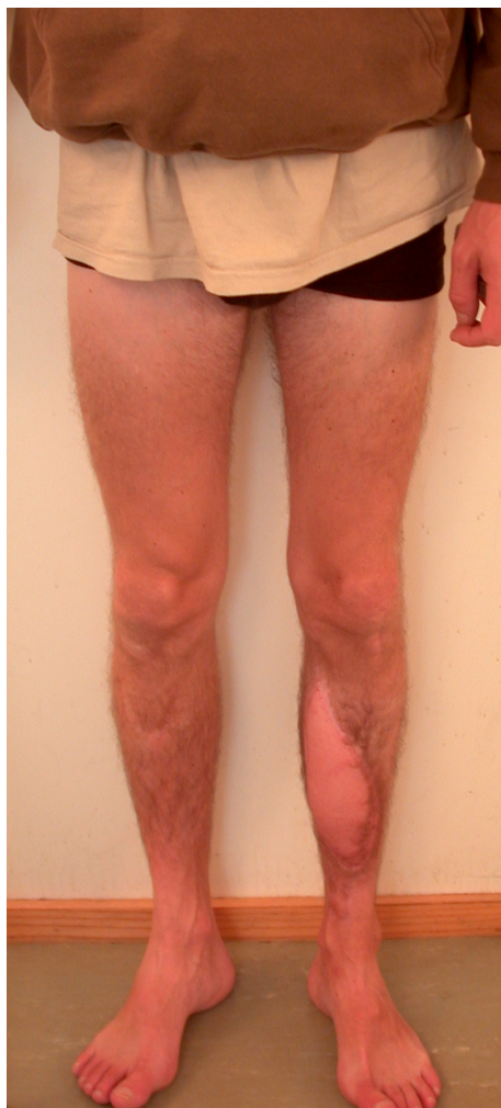
Figure 4. At 5 years follow-up, the patient was able to fully bear the weight without any pain.

nonunions, reaming followed by intramedullary nailing stimulates fracture healing and minimizes the need for bone grafting [16]. However, reaming of small medullary canals may result in increased temperatures in the core of the tibial shaft, which may have dramatic consequences, such as in our patient. We acknowledge that we did not monitor tibial shaft temperature during the procedure in our case. But, the reported excessive force that was needed to access and ream the medullary canal, as well as the immediate postoperative course made the diagnosis of osteocutaneous thermonecrosis. Also, we did not perform histological analysis on bone and soft tissue biopsies, as it often reveals nonspecific signs such as disappeared osteocytes and inflammatory cells invasion.