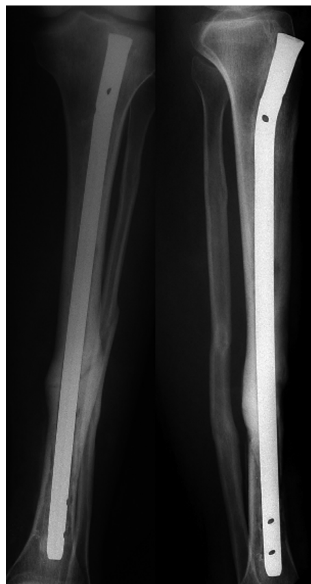
Figure 1. Initial AP and lateral X-Rays showing an important thinning of the anteromedial cortex of the left tibia.

The aim of tibial reaming was to sufficiently enlarge the canal to allow the insertion of a larger and stronger nail