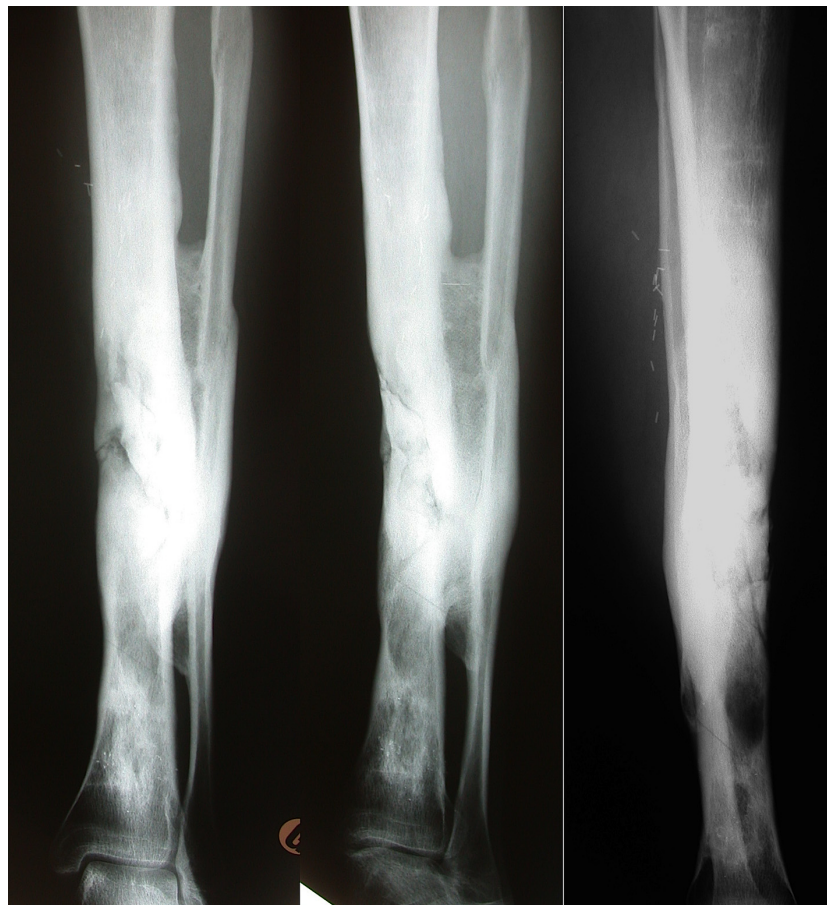
Figure 3. AP and Lateral X-Rays at 1 year postsurgery showing bone healing of the left tibia and successful engraftment of a tibiofibular graft.

that provides a more stable fixation in both the frontal and the sagittal planes. With the use of larger nails, the risk of fatigue failure of the implant and particularly of