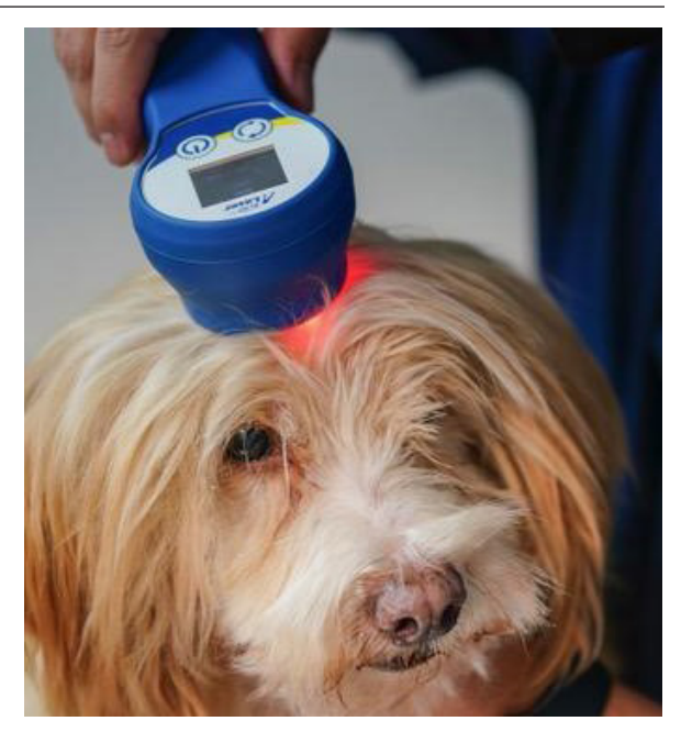
Fig. 4. Application of tPBMT to a dog using a class 1 laser.

have not been developed for dogs. Such devices would need to be available in several head sizes and may not be tolerated for the length of required treatment time in CCD patients. An alternative would be to have pet owners deliver tPBMT to their dogs at home with a small, hand-held laser unit of a lower power. Class 1 lasers do not pose the threat thermal or retinal damage and can be safely used at home by pet owners (Fig. 4). Although recommended tPBMT doses cannot be delivered as rapidly with class 1 lasers compared with higher powered devices, the authors estimate treatment times of 5–10 minutes, which may be practical for at home use. It is important to emphasize that such treatment times are estimates and that clinical trials are imperative to establish effective clinical protocols.