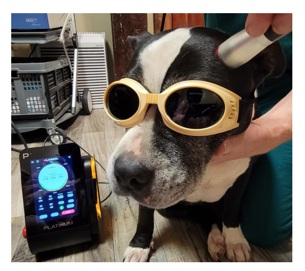
Fig. 3. Application of tPBMT to a dog using a class 4 laser. This class of laser should be used only by trained veterinary personnel.

In addition to technical considerations, there are several practical considerations to address when adapting tPBMT to dogs with CCD. Veterinary practices typically have high power medical lasers (class 3b or class 4) that require expertise and training to apply safely; lasers of these categories can treat patients very quickly, even if multiple regions require therapy (e.g., polyarthropathy). These lasers can cause thermal and retinal damage and are not suitable for home use (Bartels, 2017; Riegel and Godbold, 2017). Because of the proximity of the laser source to the eyes, the authors recommend protective eyewear for the patient when using higher power lasers (Fig. 3). It is unlikely that most pet owners will be able to transport their pets to a facility to receive tPBMT several times per week for an extended time period. Several wearable devices have been developed for treating people with cognitive decline. These devices deliver tPBMT via light-emitting diodes (LED) that contact the surface of the scalp; LED devices are very low power, compared to conventional medical lasers, so treatment sessions are fairly long (25-30 minutes) (Naeser et al., 2014; Hennessy and Hamblin, 2017; Saltmarche et al., 2017; Hamblin, 2019; Huang, et al., 2020). Similar devices