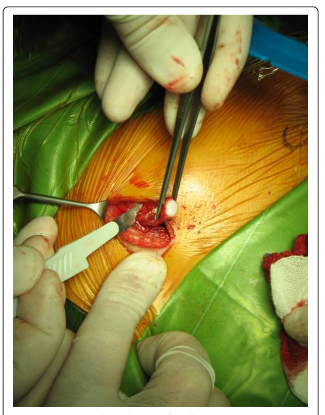
Figure 1 LTP: costal cartilage graft collecting.

We adopted the Myer-Cotton classification of subglottic stenosis [1] into 4 degrees depending on the percentage of lumen occlusion (table 1). Laryngotracheoplasty (LTP) consists in the enlargement of the lumen of the airway by inserting a costal cartilage graft (usually in the anterior wall) (Figure 1 and 2). Cricotracheal resection (CTR) consists in the resection of the stenotic tract, including the anterior ring of the cricoid and the involved tracheal rings, and the anastomosis between the thyroid cartilage and the first unaffected tracheal ring (Figure 3 and 4). Indication for LTP was a grade 2 stenosis while indication for CTR was a grade 4 stenosis.