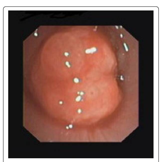
Figure 5 Endoscopy: mass occluding 70% of the tracheal lumen.

persistent dysphonia, dysphagia and grade 4 transglottic stenosis. Extended CTR with a new tracheostomy were performed and endoluminal LT-Mold stent (Bredam S. A., St. Sulpice, Switzerland) was positioned. The endotracheal tube was removed on the 3<sup>rd</sup> post-operative