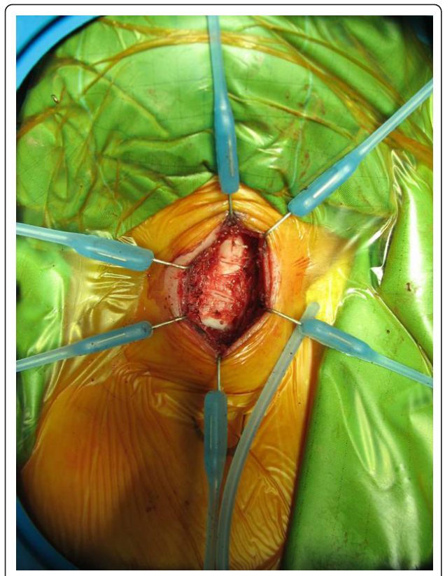
Figure 2 LTP: the cartilage rib has enlarged the anterior wall of the airway.

Grade 3 stenoses were treated by LTP or CTR, depending on the surgeon's preference. Extended CTR was indicated in the treatment of transglottic stenosis which extends from above and below the glottis and involves the vocal chords. Extended CTR also included opening