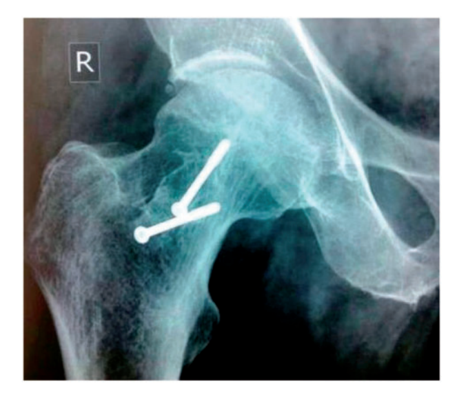
Fig. 8. X-ray R hip AP view showing 15-year follow-up of AVN femoral head operated with Sartorius muscle pedicle bone graft.

adequate vascularization in the necrosed femoral head. Urbanaik et al. [23] have used fibula (with peroneal vascular pedicle), while Babulkar et al. [24] had used iliac crest (using deep circumflex iliac vessel). These procedures require preoperative angiography to confirm the presence of patent artery for anastomosis. They have shown good clinical and radiological outcome with free vascularized bone grafts have in Ficat stages IIb, III and IV. However, these procedures are technically demanding, tedious and time-consuming and may not be feasible bilaterally, in one sitting [25].