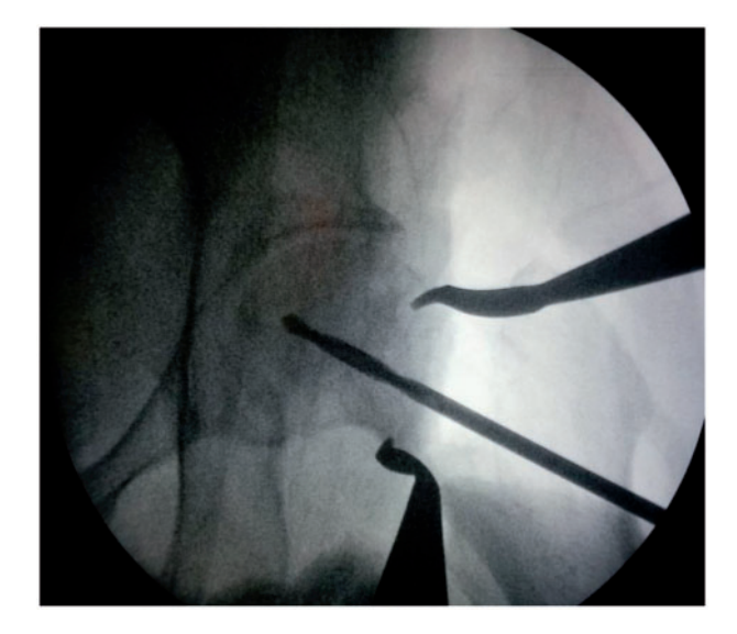
Fig. 2. A 3.2-mm drill bit is used for core decompression through window at head neck junction under image intensifier guidance.

with 4.5-mm drill bit into the necrosed area of the femur head through the window, under image intensifier control, and necrotic bone was curetted out with angled curettes (Fig. 2). The harvested Sartorius muscle pedicle was lifted along with a block of ASIS and was delivered beneath the straight head of rectus femoris into the window. The graft was secured temporarily with two guide wires and then fixed with, one or two, 4 mm cannulated cancellous screws. Precaution was taken to avoid violating the medial cortex of the femur and the region around calcar. The placement of screws was done \sim 8–10 mm lateral to the medial cortex.