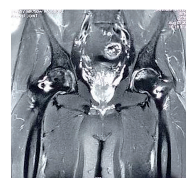
Fig. 6. MRI both hip joints showing AVN of both femur heads.

used Ficat's classification since it is simple, easy to use and has good reproducibility. It grades the disease process into four stages [18].