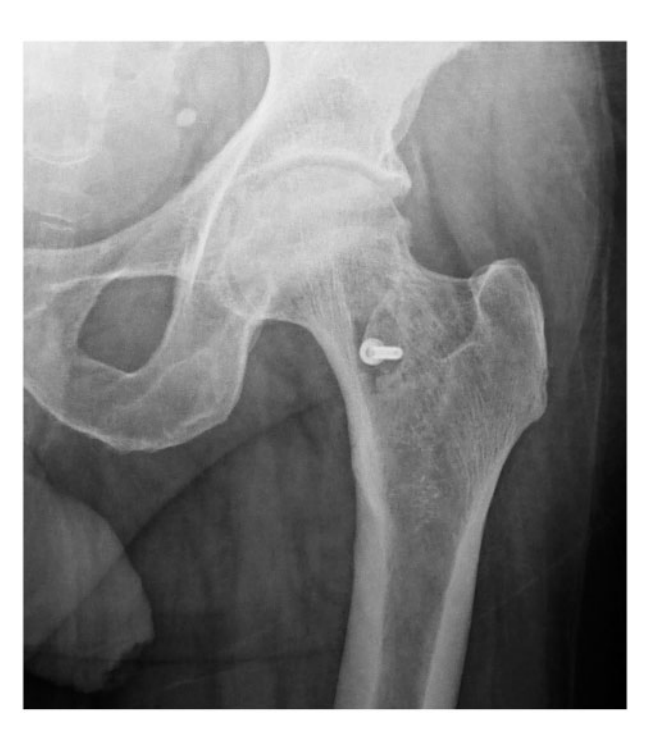
Fig. 4. AP view showing 2-year follow-up of the AVN of left femur head operated with Sartorius muscle pedicle bone graft.

(<70) in 2 hips (3.7%) (Table III). The correlation between the Ficat's stages and Harris hip score have shown that the majority of hips were showing excellent and good scores belonged to stage IIA and B while the hips with fair and poor score mainly belonged to stage III and IIB (Table IV). To test the hypothesis whether the patient's