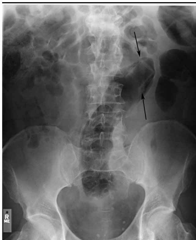
Figure 3 X-ray of abdomen 2 years prior showing outline of plastic soda bottle in sigmoid colon (arrows).

It is known that few patients with rectal foreign bodies will freely admit to transanal introduction [14]. This