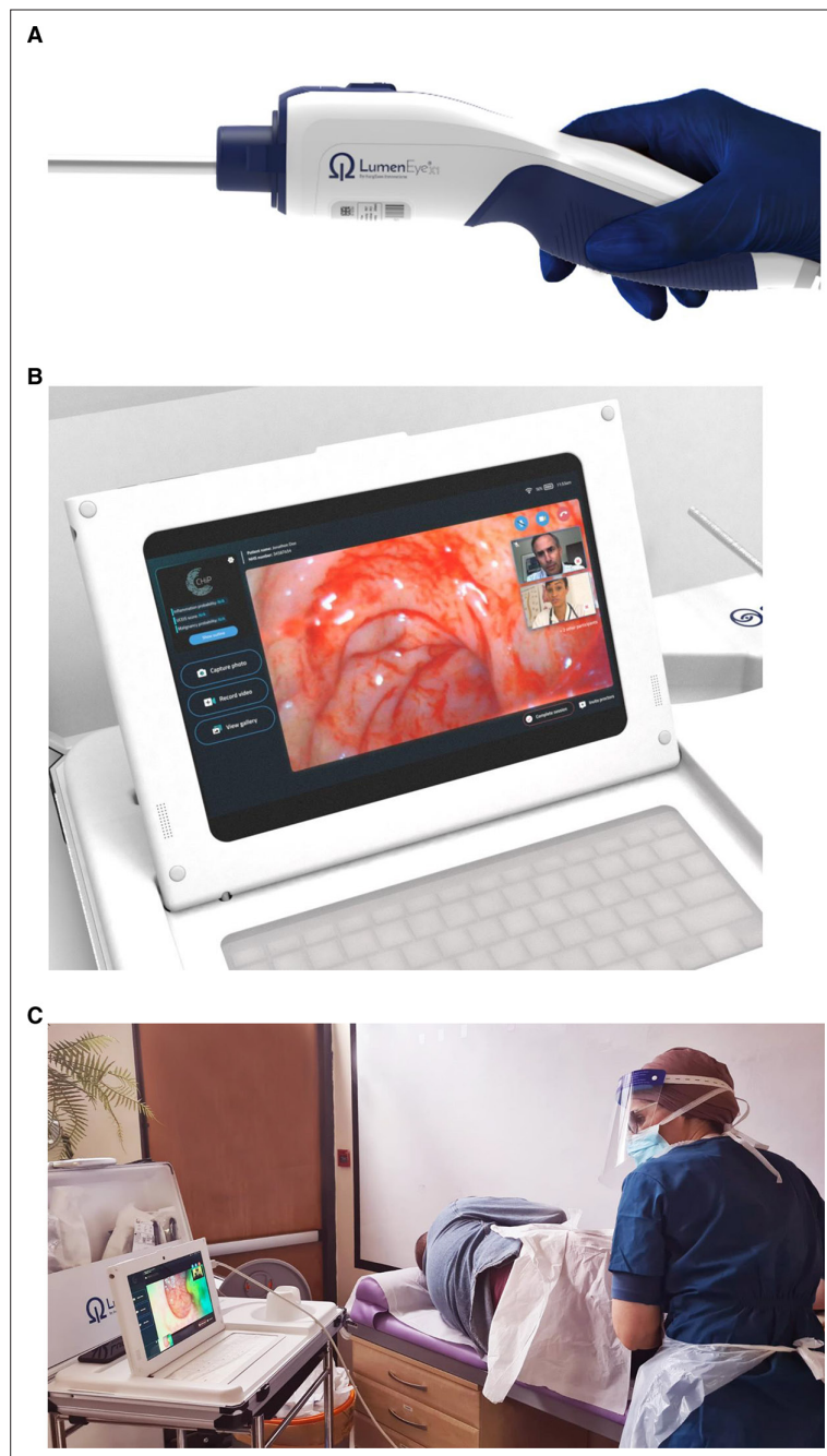
Figure 1 The LumenEye system

A - The LumenEye® device without its disposable plastic sleeve. The disposable plastic sleeve is graduated to 15cm and includes a 3mm working channel to accommodate endoscopic instruments. The handle contains an air insufflator bellows (blue) allowing single handed use.