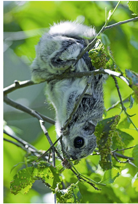
FIGURE 1 The study organism, Siberian flying squirrel Pteromys volans .

Here, we utilize long-term mark-recapture data to study natal and breeding dispersal patterns of an arboreal rodent, the Siberian flying squirrel, Pteromys volans (Figure 1). Flying squirrels were monitored in two nest-box populations from 1993 to 2014 in western Finland. By definition dispersal, both natal and breeding, is a permanent change in a home-range location (Clobert, Baguette, Benton, & Bullock, 2012). We analyze changes in location of nest sites from natal nest to breeding time nest sites during the individual lifetime. We define distance between natal nest and first breeding time nest as "natal dispersal." Adulthood nest site changes between breeding attempts are from now on called "breeding movements." We did not study permanent changes in home-range location, and breeding movements do not necessarily indicate "breeding dispersal." However, we use the data for breeding movements to discuss possible role of breeding dispersal in flying