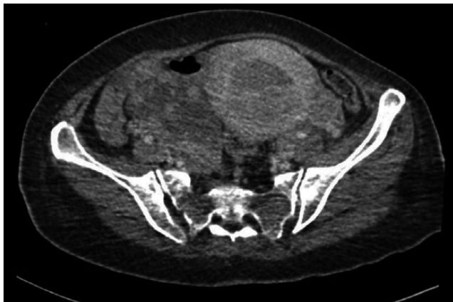
FIGURE 1 Contrast-enhanced CT scan of the whole abdomen showing enhancing masses in the bilateral hemipelvis, larger on the right

Contrast-enhanced CT scan of the whole abdomen showed enhancing foci within the uterine wall measuring 2.8 \times 5.2 cm and 1.8 \times 2.5 cm. There were enhancing masses in the bilateral hemipelvis measuring 8.4 \times 5.0 \times 6.4 cm in the right and 3.4 \times 2.5 \times 4.1 cm in the left (Figure 1). The