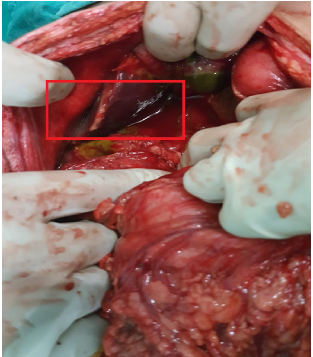
FIGURE 2: Intra-operative view of gallbladder perforation as a complication of enteric fever

No gall stones in the gall bladder, cystic duct, common bile duct, or peritoneal cavity were found. Cholecystectomy was done and the pelvic drain was placed after thorough peritoneal lavage. Postoperatively, intravenous ceftriaxone and gentamicin were administered for one week. There was uneventful recovery, and the patient was discharged on the eighth postoperative day.