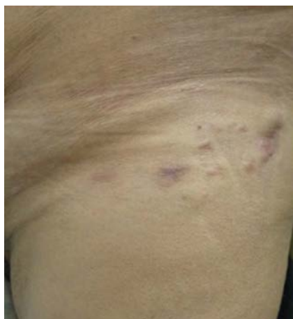
Figure 1. Cluster of deep red-to-brown firm, indurated erythematous nodules on the left upper thigh.