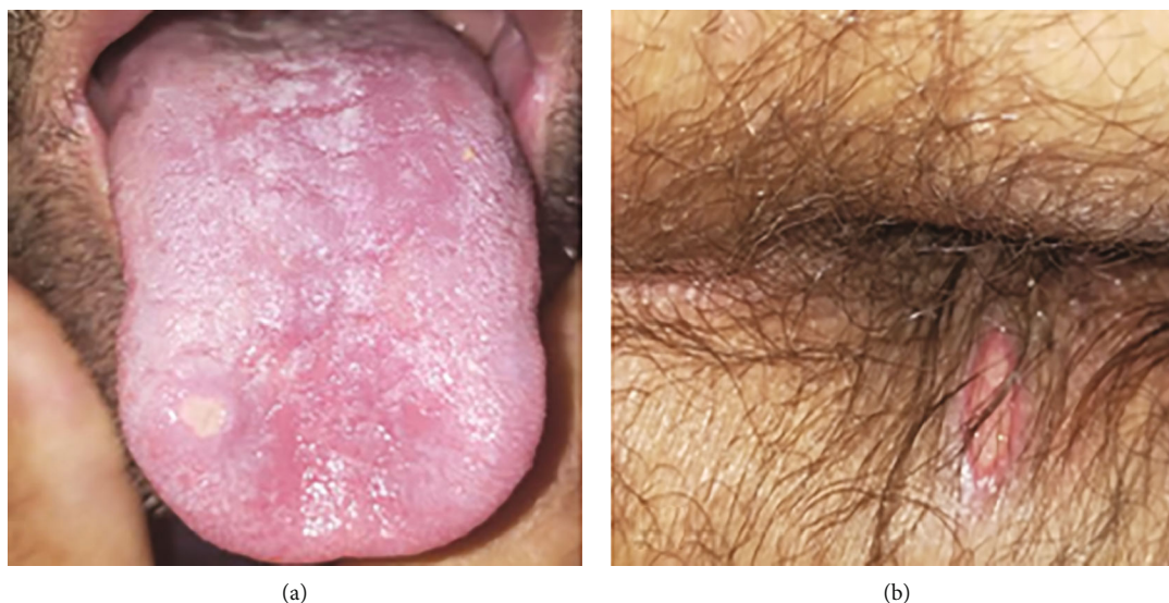
FIGURE 4: Oral (a) and genital (b) aphthosis.

prognosis. Thrombosis of the hepatic vein predicts poor prognosis during venous involvement with a 9 times higher mortality rate. 57% of deaths in arterial involvement are linked to aneurysm or pseudoaneurysm, mainly of the thoracic and abdominal aorta which can rupture or the pulmonary artery which can lead to massive hemoptysis. Septic and neoplastic side effects of immunosuppressant drugs are also major prognosis factors [8].