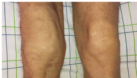
FIGURE 1: Arthritis of the right knee.

Ocular manifestations can be severe and include anterior or posterior uveitis and retinal vasculitis. Neurological manifestations can be parenchymal such as meningitis and meningoencephalitis or nonparenchymal linked to the