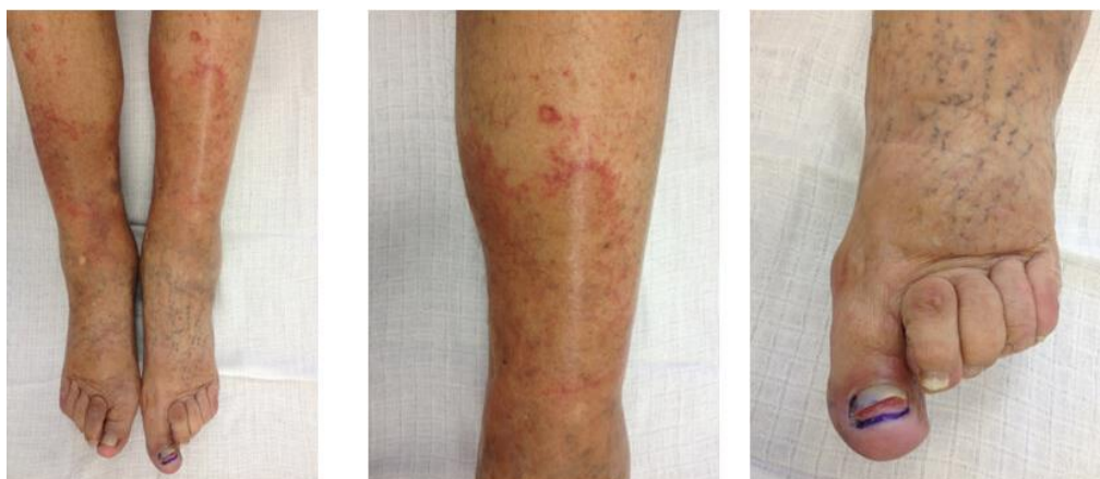
Figure 2. Palmar-plantar erythrodysesthesia (PPE or hand-foot syndrome). A 64-year-old patient with platinum-resistant ovarian cancer was included in the first Czech clinical study (EudraCT number 2016-000971-26). The study was approved by the Ethics Committee of Charles University and the Faculty of Medicine in Hradec Králové number 201506S30P and by the State Institute for Drug Control Czech Republic number SUKLS 74616-2016. The patient was treated with a 1-h IV infusion of 50 mg/m 2 of PLD/cycle without plasma filtration. PPE (grade 3) was observed during the second cycle, which was treated with corticosteroids, antibiotics, and analgesics for three weeks.