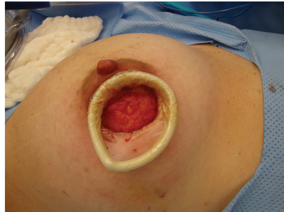
Fig. 1: Peri areolar approach.

adenectomies, only one incision was made in the inframammary sulcus measuring between 9 to 12 cm long to remove the mammary gland and the sentinel lymph node or axillary lymph node dissection. A bigger wound retractor was inserted through this opening. Next an upper flap was made through the dissection of the superficial fascia. Later, through the deep fascia dissection, we displaced the mammary gland