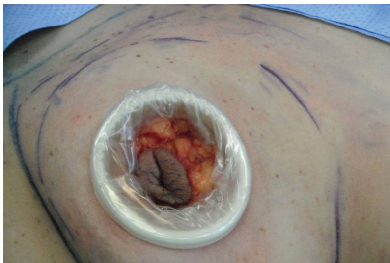
Fig. 4: Skin sparing mastectomy.

We performed 31 surgical procedures using the single-incision technique: prime incision and modified moving window. There were 30 patients with primary breast cancer diagnosis stages I and II and 1 with loco-regional recurrence. We performed conservative surgery in 23, adenectomies in 7, and an axillary incision for level