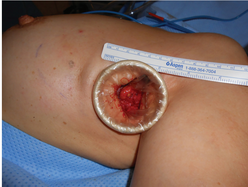
Fig. 3: Axillary incision.

from the lower musculature. After having the breast totally superficially and deeply detached, we delimited the superior, lateral and medial edges and removed it. Through the cavity created with mammary gland removal and using retractors with light and smoke evaporator, the axillary region was approached.