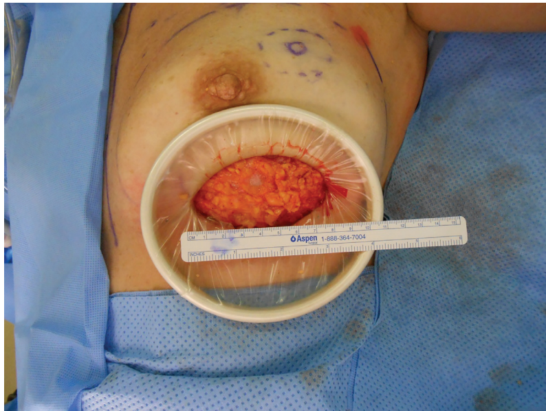
Fig. 5: Nipple sparing mastectomy with incision in the infra mammary sulcus.

III interpectoral lymphadenectomy in 1. Among 23 patients who received the conservative surgery, the tumor was in the supero lateral quadrant in 8, the infero medial quadrant in 2, the supero medial quadrant in 4, the infero lateral quadrant in 2, the intersection of superior quadrants in 3, the intersection of inferior quadrants in 1, the intersection of medial quadrants in 1, and in the lateral quadrants in 2 (Figure 1).