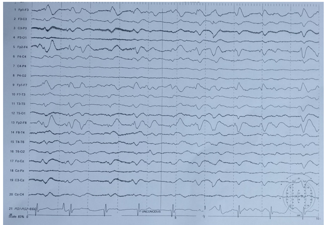
FIGURE 3: EEG showing severe diffuse encephalopathy of non-specific nature.