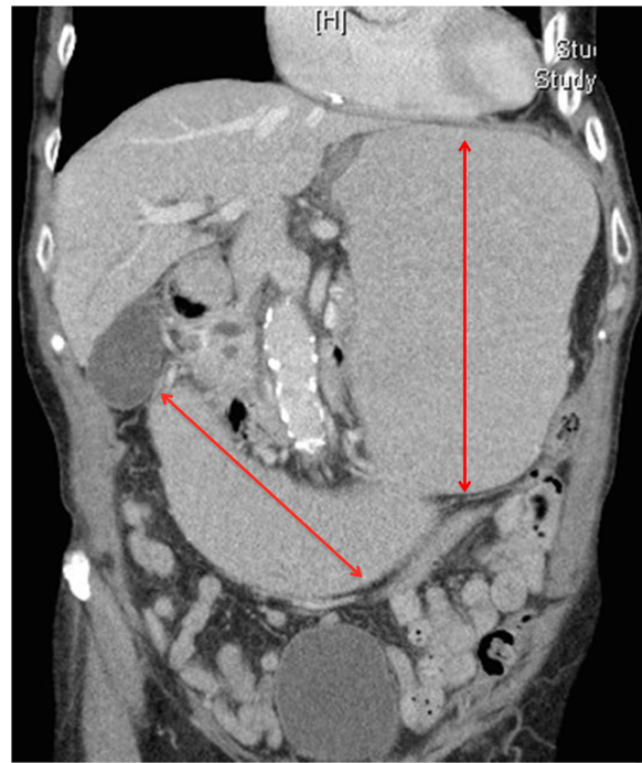
Figure 1 Computed tomography of the abdomen showing gastric and duodenal distention (red arrows) suggestive of small bowel obstruction and narrowing of the angle between the superior mesenteric artery and the abdominal aorta.

The patient was kept nil per os on total parenteral nutrition and intravenous fluids for 2 days, upon which