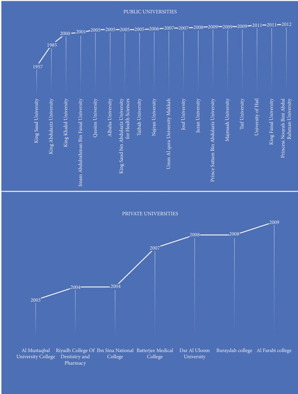
FIGURE 2: Public and private universities in the KSA.

This demographic statistic showed that most of the dentists are working in the private sector, with only one-third of the total dentists working in the public sector.