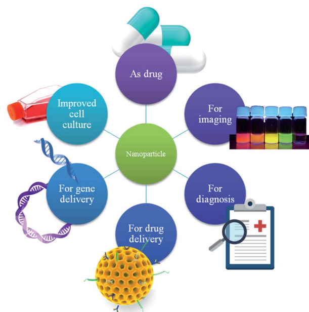
Fig. 3 Scheme showing various applications of nanoparticles in cardiac stem cell therapy.

One of the major difficulties associated with stem cell therapy for MI is in mimicking the structural, chemical and physical environments of a damaged heart, in vitro . In the case of cardiac tissues, factors such as the shape and characteristics of the extracellular matrix are important for the successful development of functional and dynamic cardiomyocytes. The role of growth hormones and various physical stresses such as cell–cell tension and electrical stimulation also have to be considered. The development of 3D structures that can support the growth of stem cells are possible due to the advancements in nanotechnology. They can even facilitate the differentiation of stem cells to functional myocardium. Scaffolds made of nanofibers, which have high tensile strength and surface area facilitates easy exchange of nutrition and waste with the extracellular environment. 109 50–500 nm-sized fibers can be developed using methods such as phase-separation, electrospinning and self-assembly. 110,111 It has also been shown that nanofiber