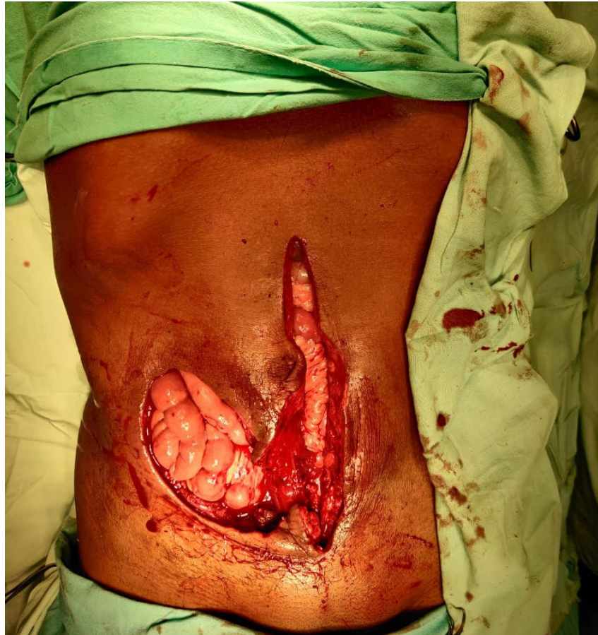
Figure 1: A 42-year-old patient operated for abdominal wall tumour. A full thickness defect of 14 x 8 cm after tumour resection

One patient developed abdominal wound infection in postoperative period and was treated with dressing and antibiotics.