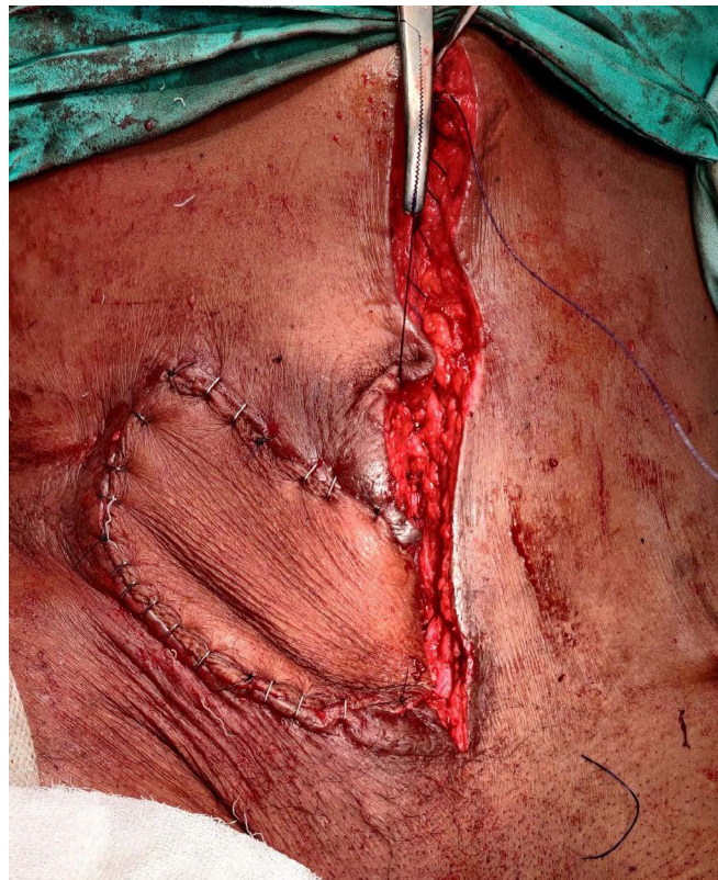
Figure 4: Flap after inset