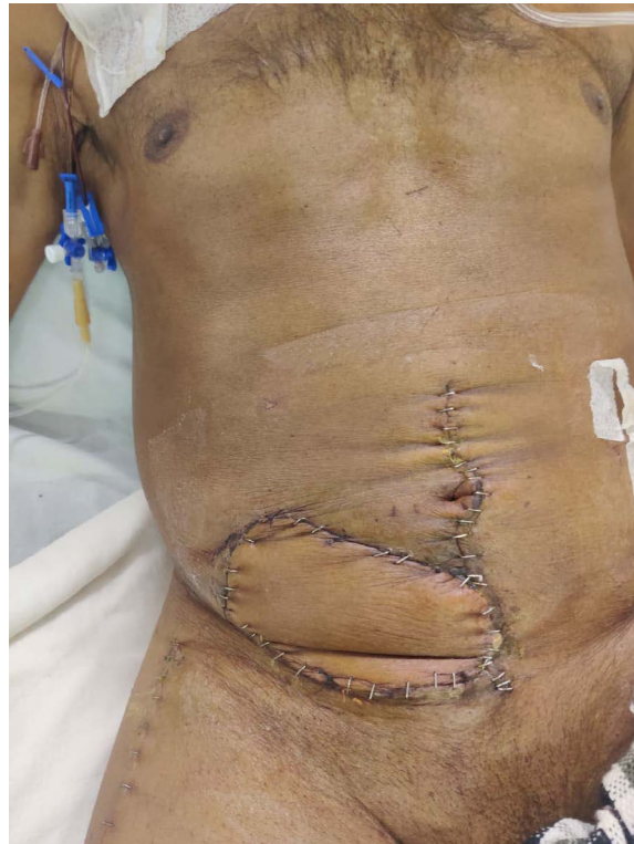
Figure 5: Post operative picture