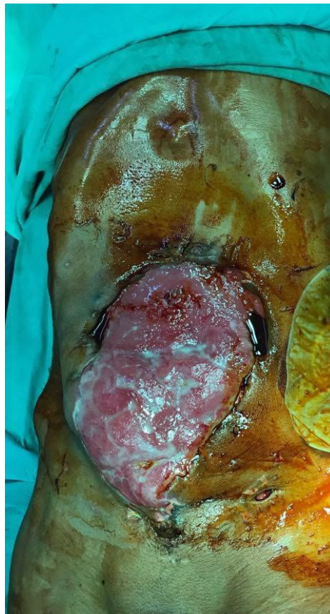
Figure 6: A 40-year-old patient with history of laparotomy for perforation, presented with abdominal wall defect of size around 25 x 18 cm.