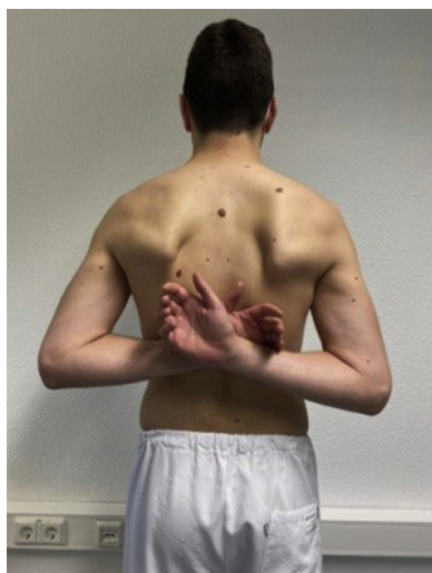
Figure 1 First step of IRO/shift-test, bilateral active shoulder internal rotation.