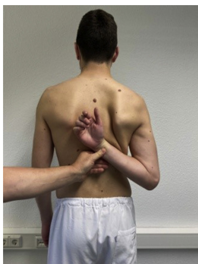
Figure 2 Second step of IRO/shift-test, clinician applied passive shoulder adduction and internal rotation.

pathology found on MRI. 10 of these patients were diagnosed with a partial rotator cuff tear, while the remaining 55 had a full-thickness tear. Among the 35 patients who did not have a rotator cuff tear, there were a variety of pathologies found, including biceps tendon pathology, osteophytosis, bursitis, calcific tendinitis, AC joint arthrosis, and SLAP lesions. 60% of these patients had both a positive IRO/shift-test and objective rotator cuff tear via MRI; while only 15% had a positive IRO/shift-test and a negative finding on MRI. 5 patients presented with a positive IRO/shift-test and a subsequent positive follow-up O'Brien's test resulting in an overall negative clinical diagnosis. The sensitivity of the IRO/shift-test to detect superior rotator cuff lesions based on MRI diagnosis was calculated at 92% (95% CI: 86-99%), specificity was 67% (95% CI: 50-84%). PPV and NPV were determined at nearly the same high level with 86% (PPV 95% CI: 78-94%) and 80% (NPV 95% CI: 64-96%).