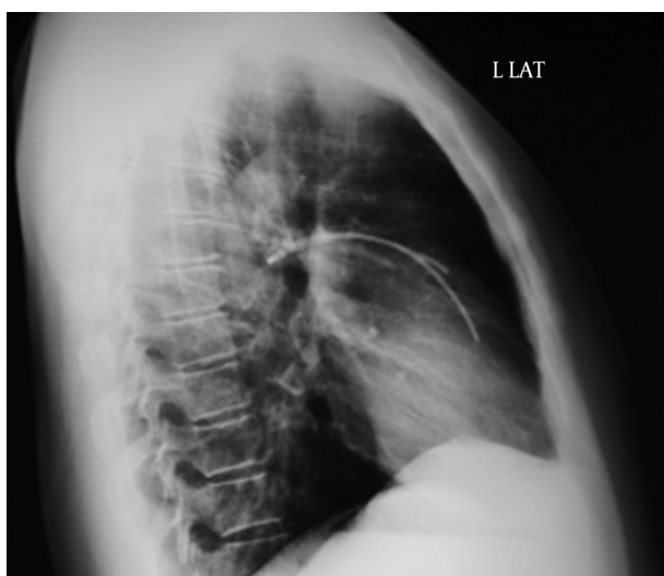
Figure 2. CXR Lateral View

Broken part is seen in this catheter is clear.