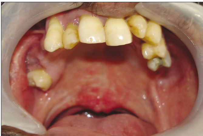
Fig. 1. Pretreatment intraoral view showing low draped soft palate with bifid uvula.

Initially, an edentulous interim palatal plate with palatal lift extension (Fig. 2A) was fabricated using heat cure acrylic resin (DPI Heat Cure, DPI, Mumbai, India) and was given to the patient for a period of one month. This was done with the purpose of getting the patient accustomed to the feel of the prosthesis and the pressure exerted by the palatal extensions. After one month bite registration was done using bite registration paste (Reposil, Dentsply, Milford, USA) and a new interim acrylic palatal lift prosthesis replacing the missing teeth along with lower complete denture (Figs. 2B and 2C) having balanced occlusal scheme was given to the patient for another