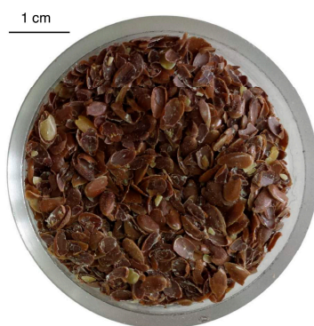
Figure 1. Physical aspect of flaxseed hulls.

Flaxseed ( Linum usitatissimum ) hulls (Figure 1) of the “Comtess” variety were obtained after mechanical dehulling of seeds by abrasion.