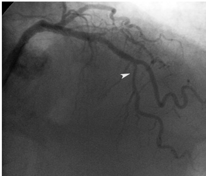
Fig. 1. A severe lesion in the middle portion of the left anterior descending coronary artery (arrow head).

The patient was discharged 3 days after the procedure and did not experience any additional clinical events. At 4 months follow-up, the patient had remained asymptomatic.