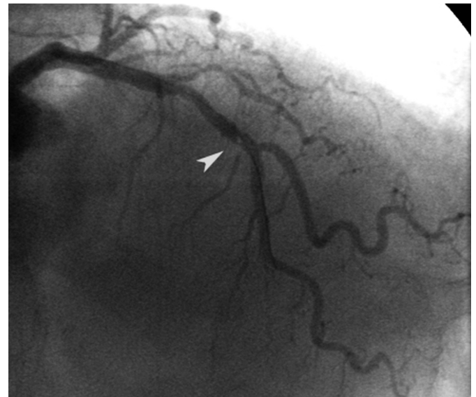
Fig. 2. Intrastent luminal hazy image on the middle portion of the left anterior descending coronary artery (arrow head).