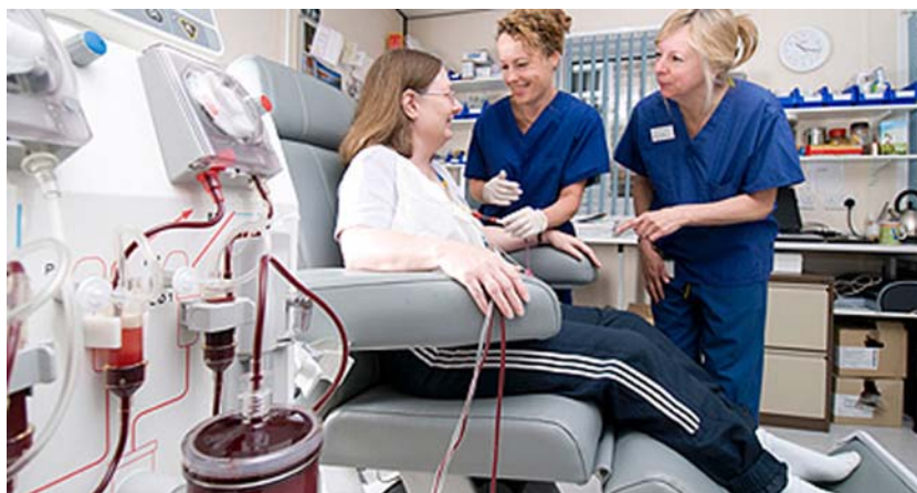
Figure 2. A patient undergoing lipoprotein apheresis using the Kaneka whole blood system (DX21).

Lipoprotein apheresis can be carried out using several methods. The most commonly used are dextran sulphate cellulose adsorption (DSA), heparin-induced extracorporeal LDL-cholesterol precipitation (HELP), immunoabsorption, double filtration plasmapheresis (DFPP) and direct adsorption of lipoproteins (DALI). In the DSA, HELP, immunoabsorption and DFPP systems, plasma is separated from red blood cells prior to removal of LDL-cholesterol and Lp(a), whereas in DALI and direct haemoperfusion (DHP), these lipoproteins are removed directly from whole blood. 33 Figure 2 shows a patient undergoing lipoprotein apheresis using the Kaneka whole blood system (DX21).