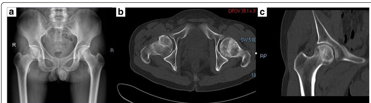
Fig. 1 a-c Pre-operative X-ray and CT images of hip joint

decompression was done: the necrotic bone and granulation tissue were scraped thoroughly with a curette. After core decompression, a porous bioceramics rod (10 mm in diameter and 90 mm in length) purchased from Shanghai Bio-lu Biomaterials Co., Ltd., China, was inserted according to the depth of the channel. C-arm fluoroscopy was used to confirm the angle, position, and depth of core decompression. The control group received traditional X-ray-assisted core decompression and porous bioceramics rod placement.