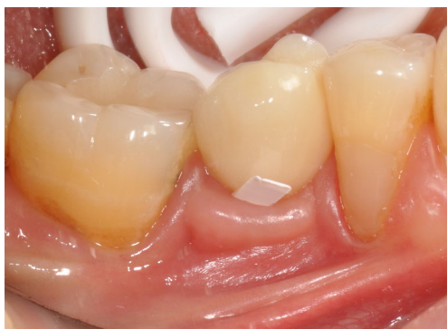
Fig. 1 Peri-implant crevice fluid sampling using a Durapore® membrane strip

Biomarkers were assessed in PCF and GCF using a multiplex fluorescent bead-based immunoassay and the Bio-Plex 200 suspension array system (Bio-Rad Laboratories, Hercules, CA, USA). The human cytokine 12-plex kit (Kit M5000HIVRK, Bio-Rad Laboratories, Hercules, CA, USA) included the following 12 cytokines: IL-1 \beta , IL-1RA, IL-6, IL-8, IL-17, basic FGF, G-CSF, GM-CSF, IFN- \gamma , MIP-1 \beta VEGF, and TNF- \alpha . The assays were performed in 96-well filter plates according to the instructions of the manufacturer. In brief, the specimens were eluted in the assay buffer provided in the system's kit. Microsphere beads coated with monoclonal antibodies against the 12 analytes were added. P/GCF samples, controls, and standards were incubated for 30 min in separate wells. Using vacuum filter, the wells were washed, and a mixture of biotinylated secondary antibodies was added. After another 30 min of incubation, the plates were washed again, and streptavidin conjugated to the fluorescent protein phycoerythrin was added. After 10 min, the plates were washed once more to remove the unbound reagents, and the assay buffer was added. The beads (minimum of 100/analyte) were analyzed in the suspension array system. The lowest detection limit varied between 1 and 2.24 pg/ml, except for IL-1RA and TNF- \alpha , where the limits were 5.63 and 6.63 pg/ml, respectively.